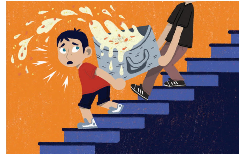
ILLUSTRATION BY JON MARCHIONE

To visit many beach communities in Rhode Island is to get a whiff of clam cakes and chowder, a distinctly different take on hush puppies and ... what most other people would consider clam chowder. There's Point Judith (if you can smell them over the day's catch on the docks) and Narragansett and a personal favorite, Warwick Neck.