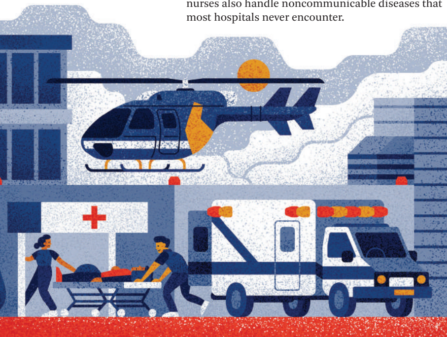
ILLUSTRATION BY MUTI

This year, Lifeline celebrates its 25th anniversary and now serves more than 22,000 patients annually. Lifeline has a special volunteer team that handles communicable diseases, such as Ebola, and Lifeline nurses also handle noncommunicable diseases that most hospitals never encounter.