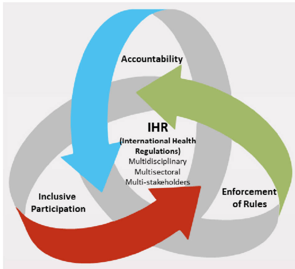
Figure 2 Key governance principles essential in strengthening IHR compliance. IHR, International Health Regulations.

within and across different ministries. This includes partnership working with civil society organisations (CSO) and bilateral and multilateral organisations due to the ‘changing nature in increasing emergence and re-emergence of infectious, non-infectious and other PHEIC across the world’. 13 Furthermore, fostering a culture of internal coherence and joint working between different departments of the MOHS as well as outside the ministry is recognised as vital. In this context, good governance is critical as without it collaboration and multisectoral working cannot be effectively achieved. However, governance is an abstract and diffuse concept. 27 28 To promote governance in one single sector itself is challenging. Hence, promoting governance to strengthen IHR compliance where multisector collaboration is key to its success, is even more challenging. Among different principles of governance, three governance principles—accountability; inclusive participation; and enforcement of rules—are essential to strengthen IHR compliance in Myanmar (figure 2).