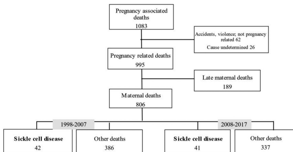
Figure 2. Case selection process – Jamaica maternal mortality surveillance database, 1998–2017.

164 (9.7%) had sickle trait (AS), and 23 (1.4%) had a sickling disorder (SS, 13; SC, 5; S \beta -Thal, 5).