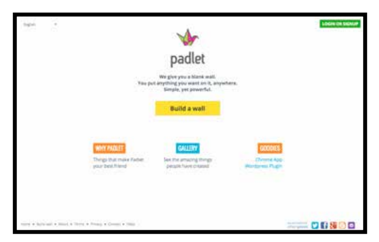
Diagram 1: Screenshot of Padlet

Tip: It is recommended that you sign-up for a free account so you can access extra features such as privacy settings and storage of your walls.