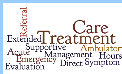
Words used in the titles of various NCI designated cancer center's urgent care clinics