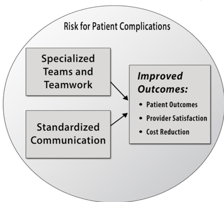
Pediatric Handover and Transport